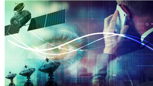
Communications and Signal Processing