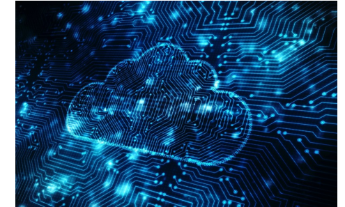
Information System Architectures