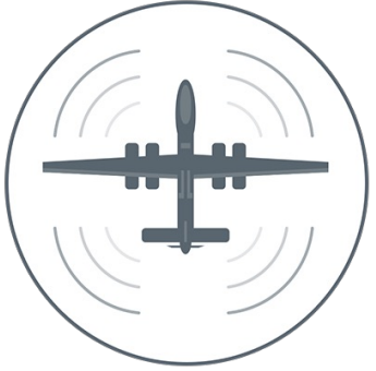
Sensing & Fusion