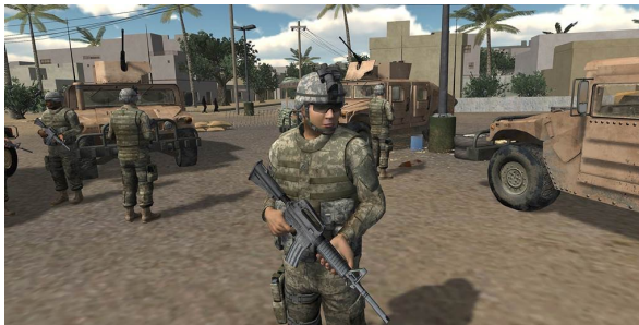
Modeling and Simulation