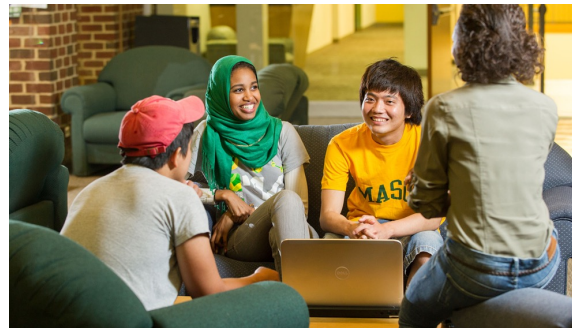
Distributed Education and Training